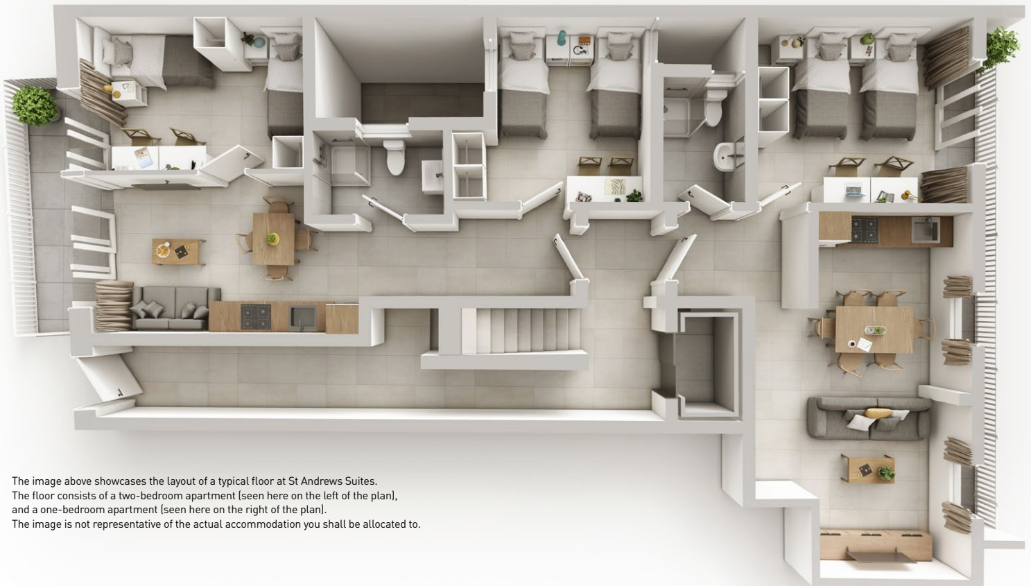
The image above showcases the layout of a typical floor at St Andrews Suites. The floor consists of a two-bedroom apartment (seen here on the left of the plan), and a one-bedroom apartment (seen here on the right of the plan). The image is not representative of the actual accommodation you shall be allocated to.

St. Julian's, St. George's Bay and Paceville are situated less than 10 minutes on foot from the accommodation. In these areas you will find a lovely sandy beach, bowling alley, restaurants, cinemas, nightclubs and shopping centres.